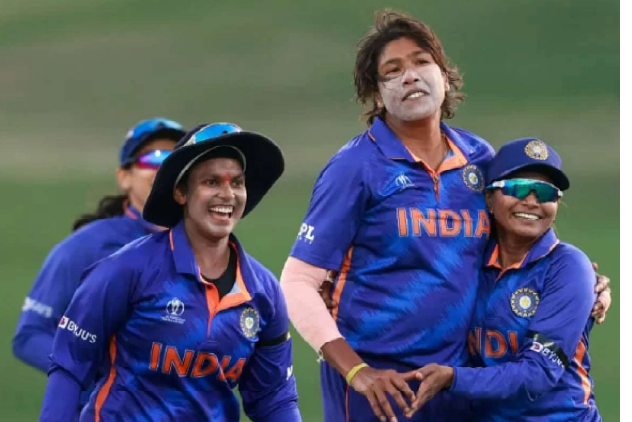
Mount Maunganui, New Zealand, March 6:

India Women got their ICC Women's World Cup 2022 Women's World Cup 2022 campaign off to a winning start by getting the better of Pakistan by 107 runs at the Bay Oval in Mount Maunganui on March 6. It was a clinical performance from India or that stored a from India as they staged a